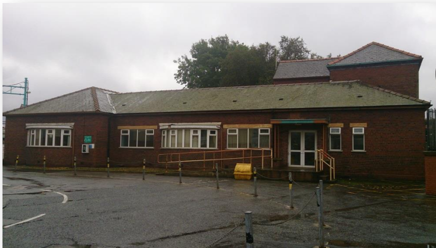
Figure 1 Extension to 2 Trinity Street (Medical Centre)